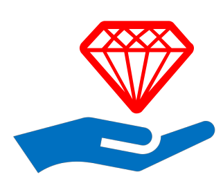
Lifestyle & Values